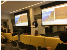
ALUMNI/-AE SPEAKER SERIES