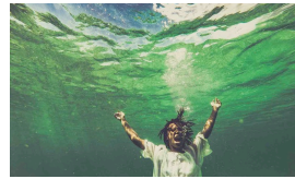
ART AND ADVOCACY IN THE AFTERMATH OF CRISIS