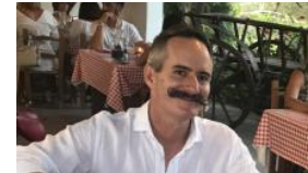
MESSAGE FROM THE CHAIR