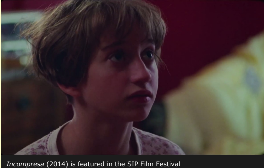
Incompresa (2014) is featured in the SIP Film Festival