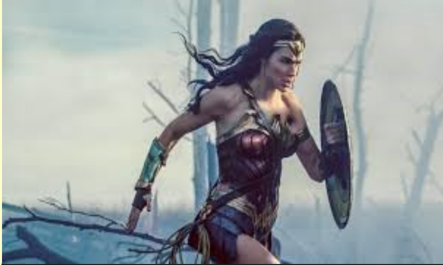
Wonder Woman (2017) is featured in the upcoming symposium.