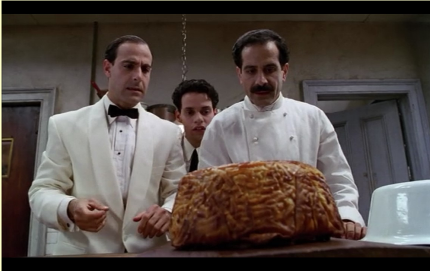
Big Night (1996) is featured in the Italian Studies film series.