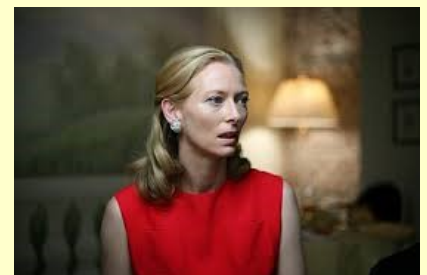
Tilda Swinton in Io sono l'amore