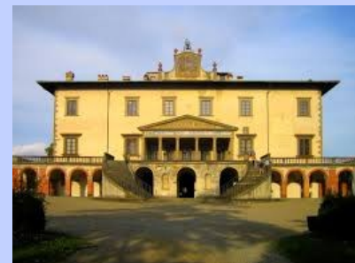
Poggio a Caiano.

Were you unable to have a Tuscan adventure this J-term? Well, don't worry, there are still lots of opportunities to study abroad in Italy, either in the summer or fall. Please note the dates below: