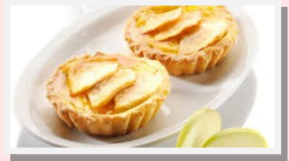
These miniature apple tarts are ready for their close-ups.