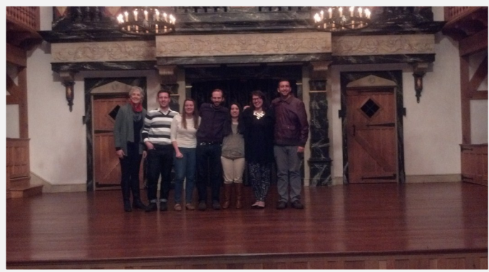
Students of "Early Modern Theater" saw their course's themes brought to life.