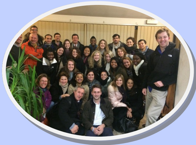
Students from UVA dined with locals in Tuscany.

This year, like most years, UVA students had the opportunity to spend J-Term in Italy: and this time 17 of them did. The students slept in a B&B in Prato, located a few miles from Florence, where they went many times to see museums, to do shopping and to visit the city's many monuments. As in past years, many activities were programmed for them so that the students could experience the "real Tuscany" for 15 days. Thanks to a collaboration with the city hall of Poggio a Caiano (Charlottesville's sister city, situated near Prato), a "dinner with locals" was also organized. The students could meet and talk with their Italian counterparts, while dining on pizza, pasta and typical Italian desserts.