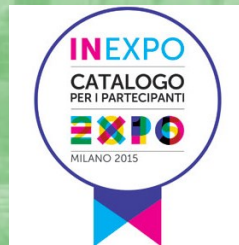
The Milan Expo

The theme is Nutrire il pianeta, Energia per la vita (Feeding the Planet, Energy for Life) .