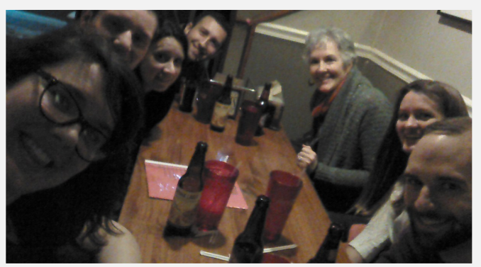
Of course, they also had to eat.