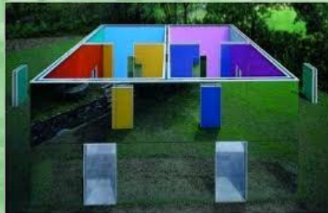
The Gori Collection in Tuscany

Located in the small town of Pistoia in the foothills of Tuscany, the entire Gori Collection is situated in the main Villa and throughout the surrounding 50 acre park. The apartment where I lived was located on the property as well, and the other intern and I were granted access to the art park at all hours. This meant that we were free to go for runs through the art park, read a book in the surrounding olive groves, or do whatever